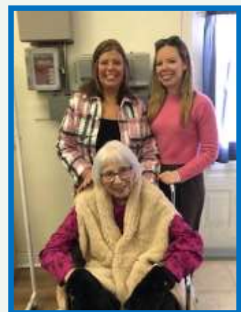
Daisy with her daughter and granddaughter at the fashion show in January 2025