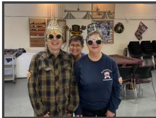
NYE Set-up Crew.