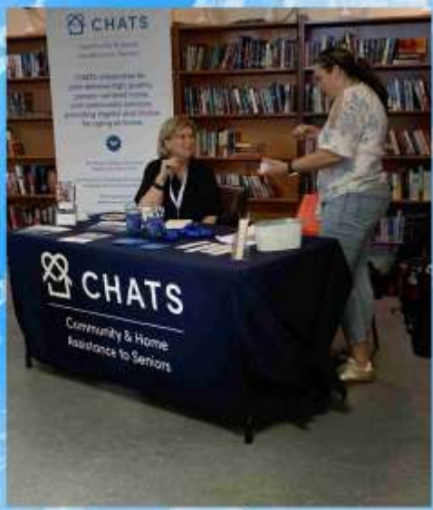
Elsbeth Heyworth Centre