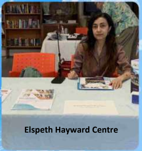
Elspeth Hayward Centre