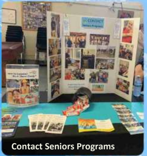
Contact Seniors Programs