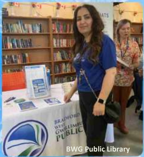
BWG Public Library