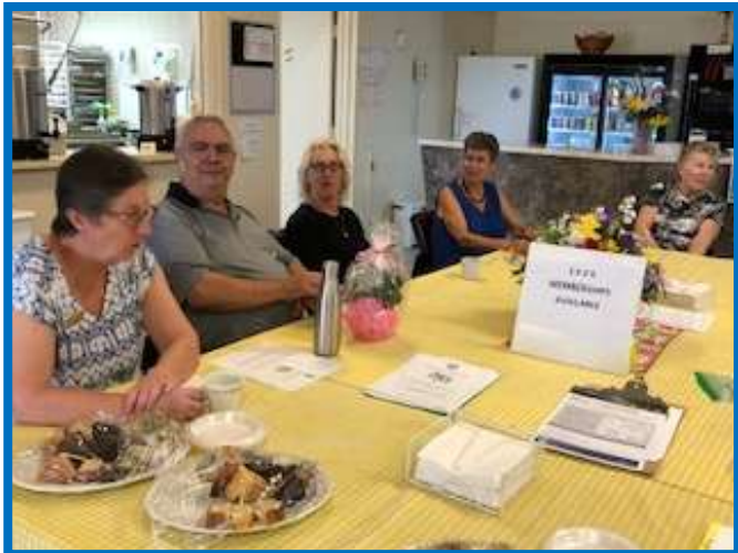
Danube volunteers relaxing after the "Lunch N' Learn" May 15, 2025