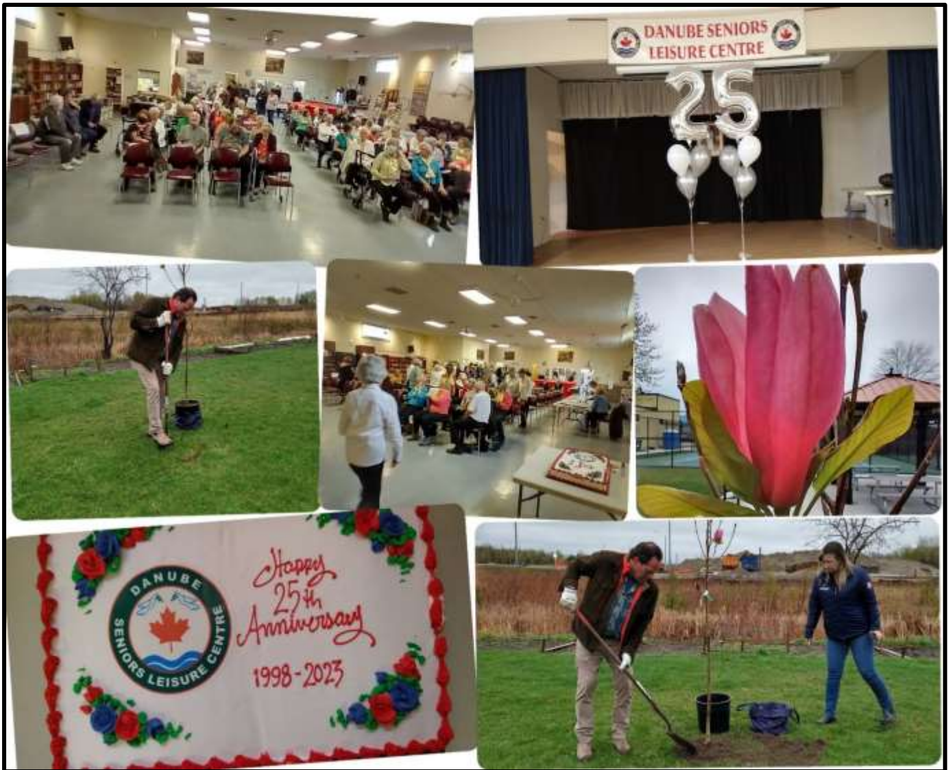
These 2 photos were taken by Alex Husick